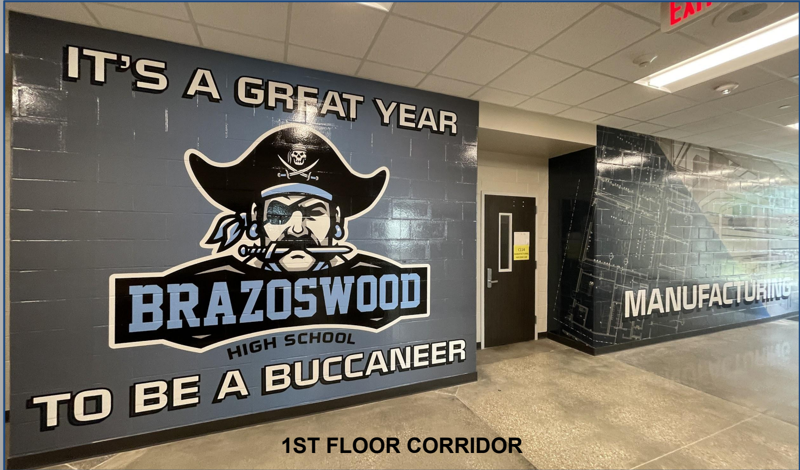
1ST FLOOR CORRIDOR