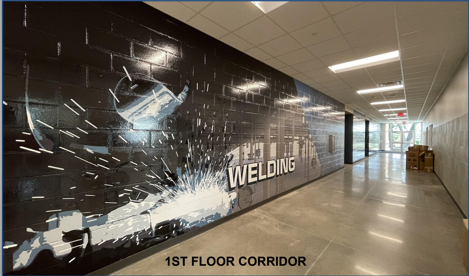
1ST FLOOR CORRIDOR