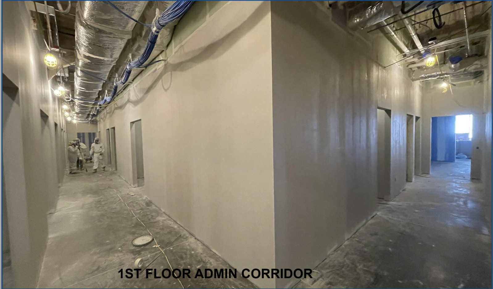
1ST FLOOR ADMIN CORRIDOR