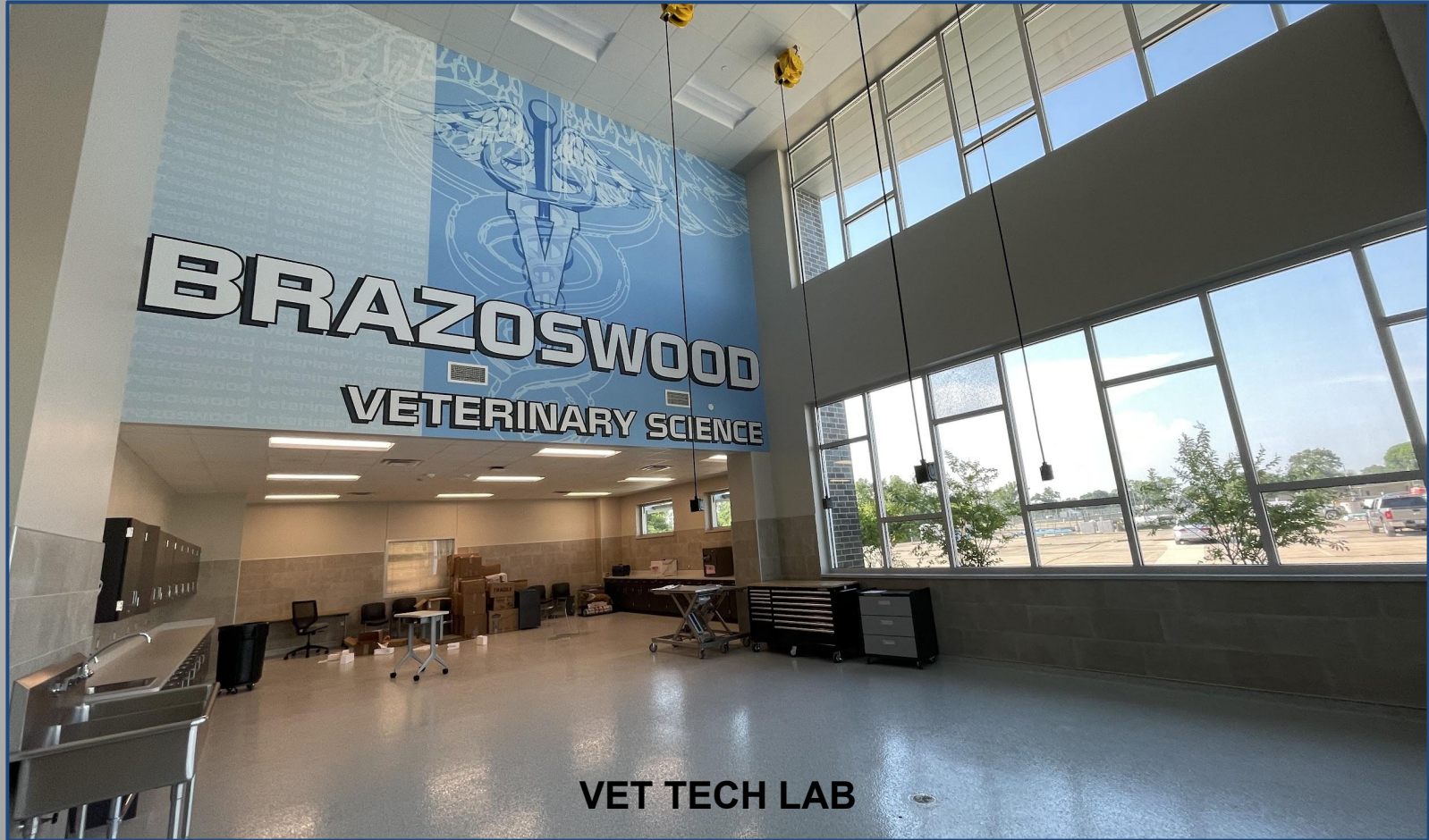
VET TECH LAB