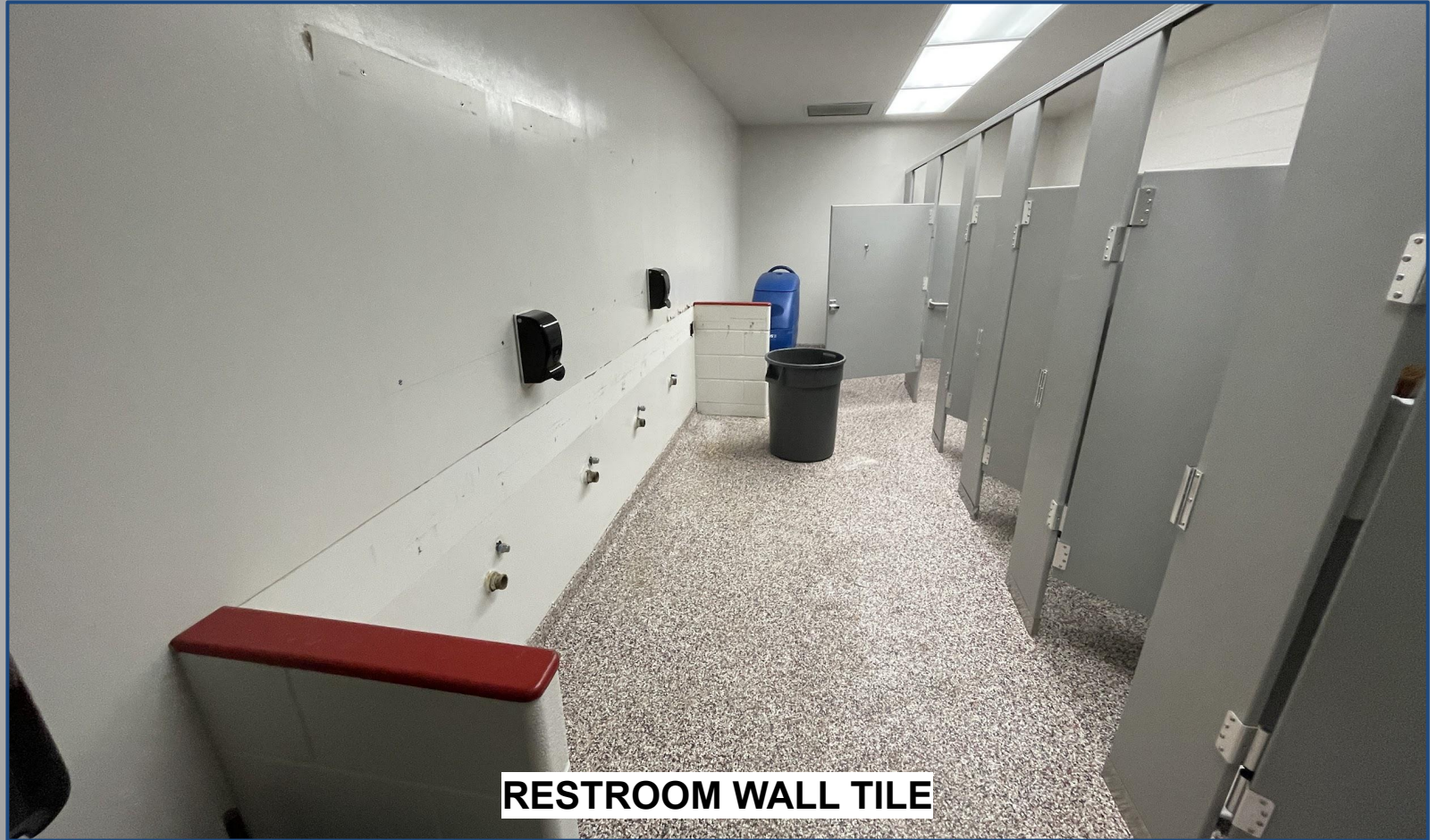
RESTROOM WALL TILE