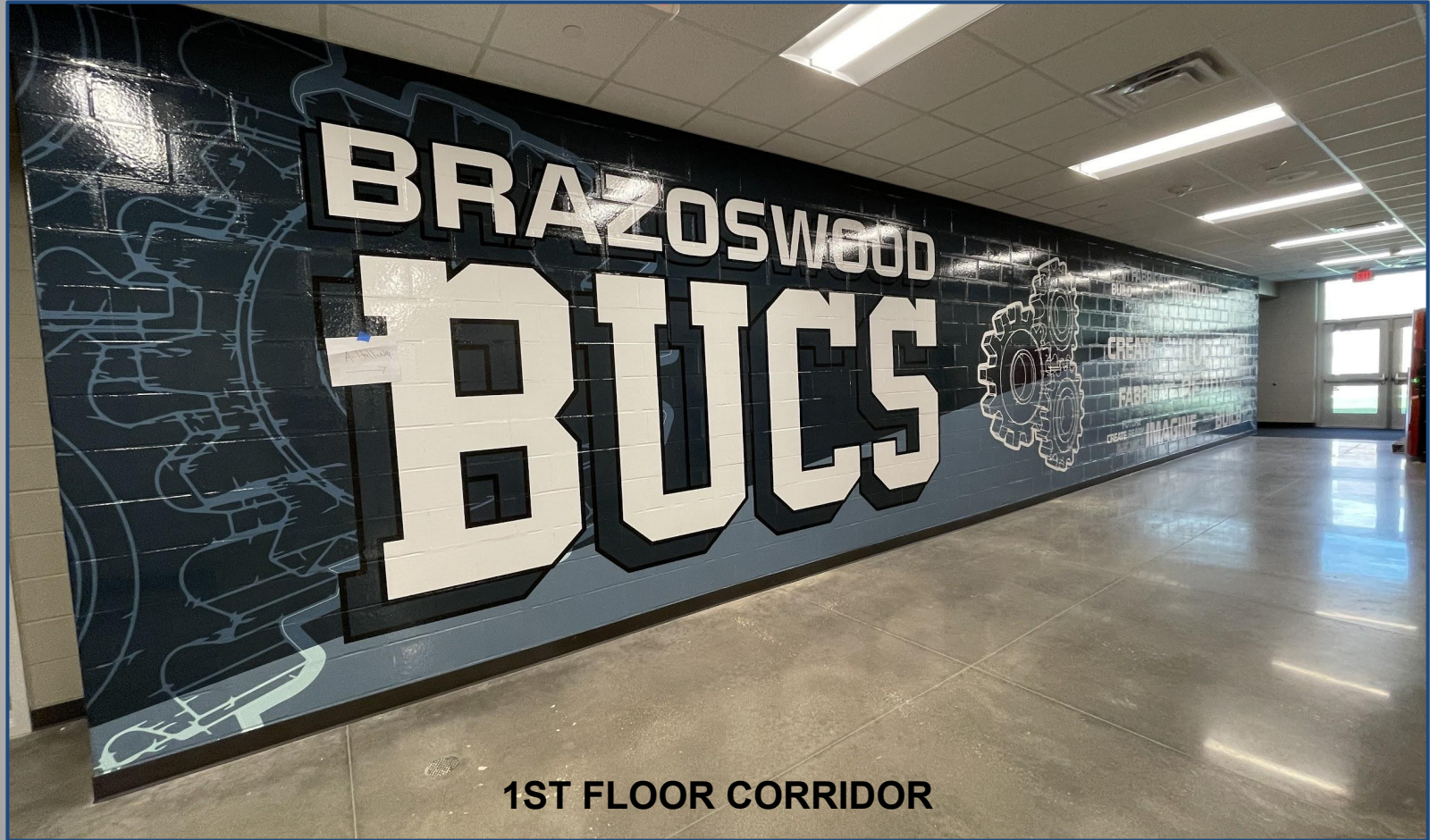
1ST FLOOR CORRIDOR